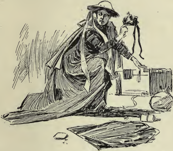
MY BEST BONNET.

'These people may be trustworthy,' I remarked, in apology, as he returned, 'and they may not, Mr. Bux. In any case, it is very wrong to put temptation in their way.'